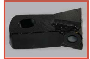
- Solid Tongue Hitch -