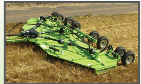
- Shredding Wheat Straw -