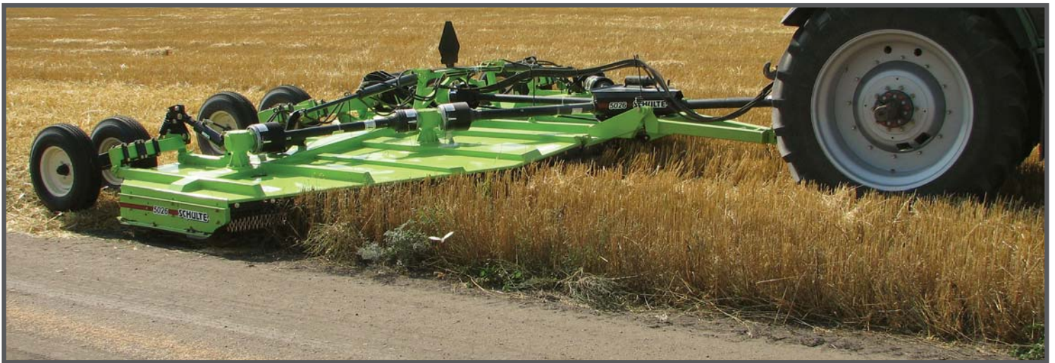
Excellent Shredding and Distribution