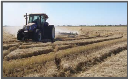
5026 In Rice

Decks include a 6' centre section and two 10' wings. This package provides a reasonable transport width (126") and height (148"). An extra wide centre section stance keeps the machine stable while it is being transported. A unique suspension system cushions the front hitch as well as the wheel standards without causing any side to side sway.