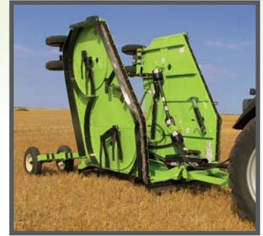
- Fixed Knife unit shown (Wings Up) -