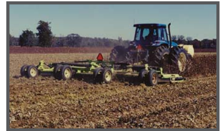
5026 in Cotton