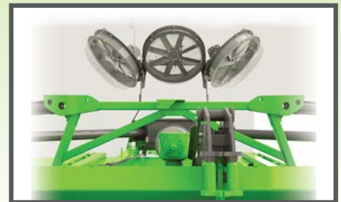
- Optional Deck Debris Fan Kit -

Trailing hitch CV style, Equal Angle Hitch non CV, Fixed Knife unit with updraft or flat bottom blades, Two blade pan kit, Two blade pan kit with shredder blades, Various chain / rubber belting safety guards, 6 or 8 tire kits with row crop or walking axles kits, safety light kit, Cyclone Deck Debris Fan Kit