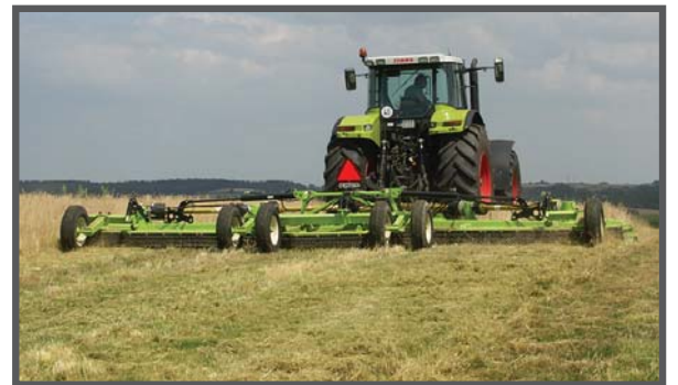
Superb Ground Following Characteristics

Over 26' of working width ensures that you get the big jobs done fast. The Schulte 5026 is designed to cut everything from light brush to crop residue such as corn stalks, wheat stubble and cotton stalks. Special blade sets are available to enhance chopping action. This machine is ideal for cutting crops like sweet clover for incorporation as green manure. The Schulte 5026 has adjustable wheel standards to fit easily into row crop spacings of 30" to 1 meter. With a maximum frame section width of 10' the Schulte 5026 does a good job of following uneven ground contours.