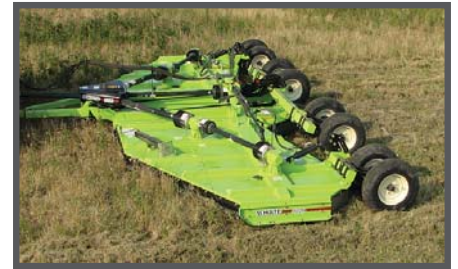
Pasture & CRP Maintenance