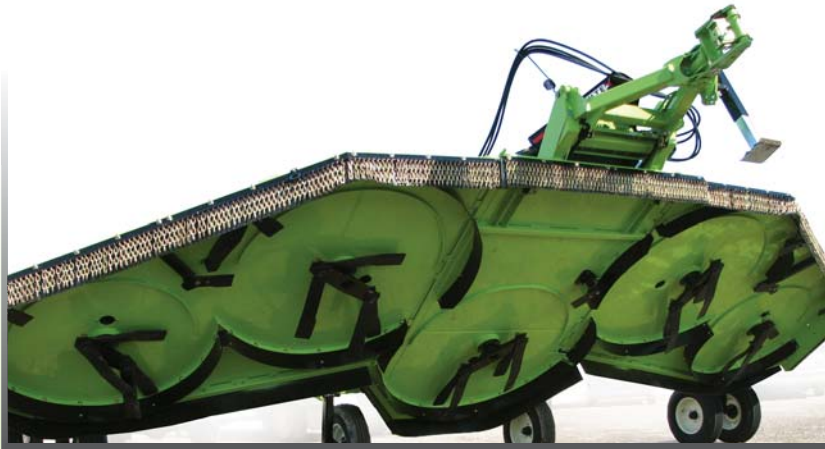
- Fixed Knife Unit Shown -