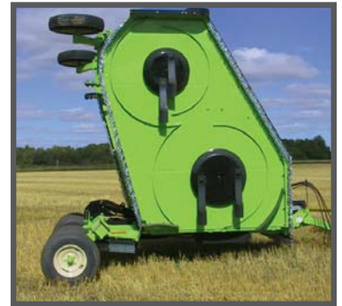
- Stump jumper unit shown (Wings Up) -