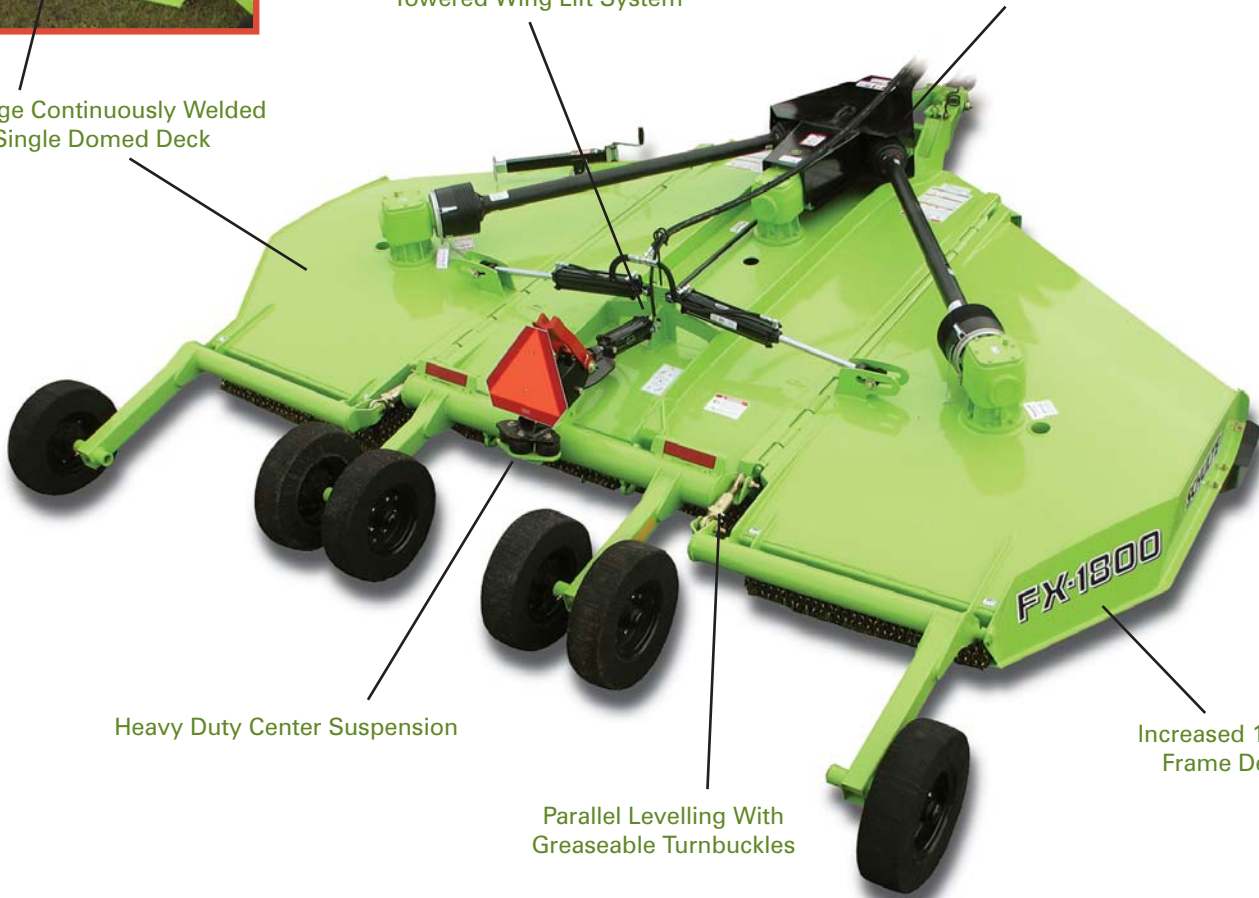
Heavy Duty Center Suspension