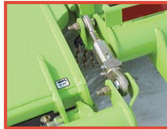
Greaseable adjustable turnbuckles for parallel levelling