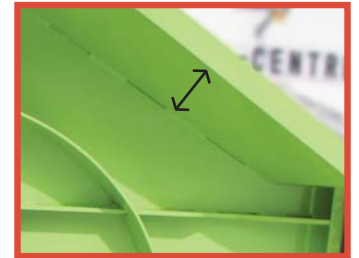
13 5/8" frame depth for maximum material flow