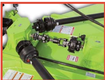
Heavy duty drive system for peak performance