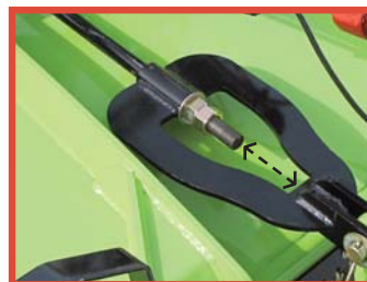
Single levelling rod with floating hitch