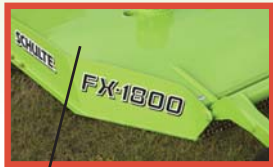
7 gauge Continuously Welded Single Domed Deck