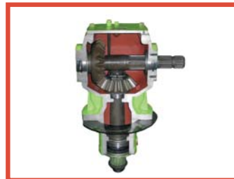
210hp Right Angle Gearboxes Heavy duty 1 3/4" input shafts. 2 3/8" tapered & splined down shafts