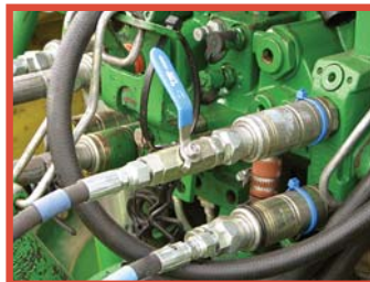
Ball valve wing lock up system