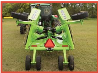
Narrow transport over-centering wing design