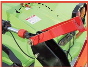
Single center lock up system