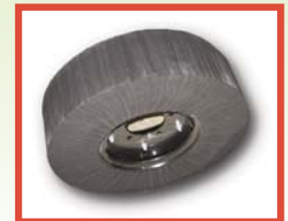
Solid Laminate Tires