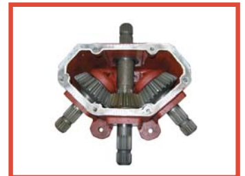
260hp heavy duty splitter box with 1 3/4" splined shafts