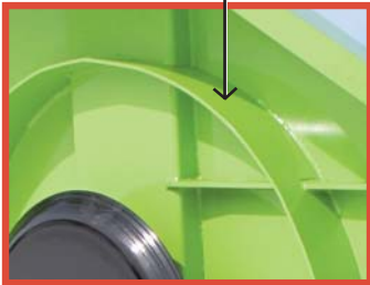
Deck protection rings are standard