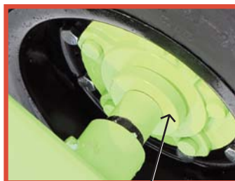
Metal seal guards on 517 hubs